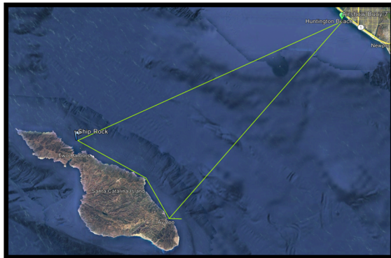
Huntington Beach to Avalon to Ship Rock and Back 73 Miles